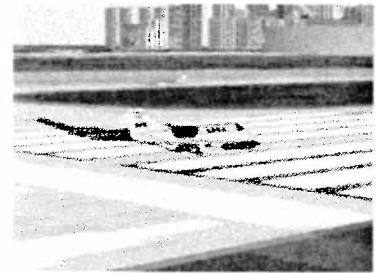
FS95 (6.0) – More scenery and aircraft. Notice the texture mapped runway, aircraft and sky.

FS 5.1 – Adding the ability to handle scenery libraries. Faster performance. Weather effects added (storms, clouds and fog).