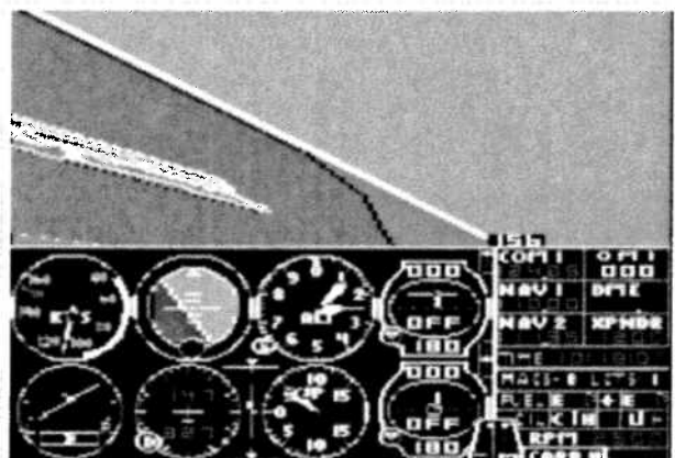
A screenshot from Flight Simulator II , showing the southern end of Meigs Field in Chicago.