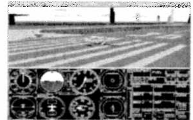
FS 4.0 – Now with dynamic scenery, more detailed roads, bridges and buildings. Allowed users to design their own aircraft.

Version 4 followed in 1989, and brought several improvements over MSFS3. These included amongst others; improved aircraft models, as well as an upgraded model of the Cessna Skylane, programmable dynamic scenery (non-interactive air and ground traffic on and near airports moving along static prerecorded paths). The basic version of FS4 was available also for the Macintosh.