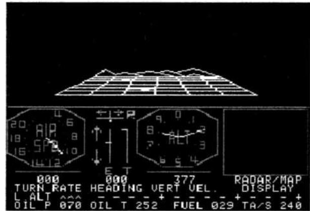
Short animation from the subLOGIC Flight Simulator 1. (The frame rate is fairly consistent with the simulator running on original hardware.)

Although still called Flight Simulator II , the Amiga/Atari ST versions were such a vast step forward that they compare favorably with Microsoft Flight Simulator 3.0 . Notable features included a windowing