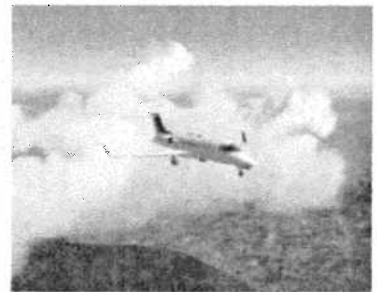
FS2004 (9.0) – Featured dynamic weather with three-dimensional clouds that could build and change realistically with the time and temperature. The Bombardier Learjet 45 is shown above.

Flight Simulator 2004: A Century of Flight, also known as FS9 was an improved version of FS2002. FS2004 was shipped with many historical aircraft such as the Wright Flyer, Ford Tri-Motor and the Douglas DC-3 to commemorate the 100th anniversary of Wright Brothers' first flight. It included an improved weather engine, which provided true three-dimensional clouds and localized precipitation for the first time. The engine also allowed users to download weather information from real weather stations, allowing the simulator to keep the weather synchronized with the real world.