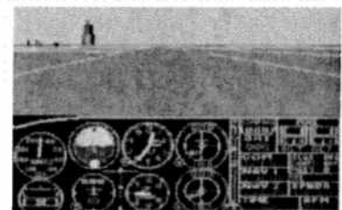
FS 2.0 – Now sports 4 color graphics. Scenery coverage includes the entire United States.