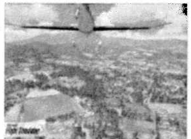
Flight Simulator X (10.0) – Improvements in AutoGen, increased ground resolution, improved lighting effects.

It is also the first of the series to be released solely on DVD due to space constraints.