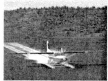
FS2002 (8.0) – AutoGen buildings, vegetation and landforms throughout the world of FS2002 were true to their surroundings.

FS2002 (8.0) improved vastly over previous versions. In addition to improved graphics, FS2002 introduced ATC and AI aircraft. Users could now fly alongside computer controlled aircraft and communicate with airports. A "target framerate" option was added, enabling a cap on the framerate in order to reduce stuttering while performing texture loading and other "maintenance" tasks. The external view also featured an inertia effect, inducing an illusion of movement in a realistic physical environment. The simulation ran smoother than Flight Simulator 2000, even on comparable hardware. A free copy of Fighter Ace 2 is included with the software.