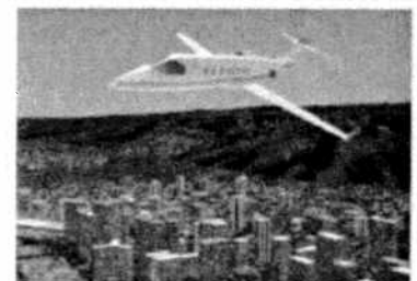
FS98 (6.1) – Ten times more airports than ever before, 3D acceleration, new aircraft, better scenery both on the ground and in the atmosphere.