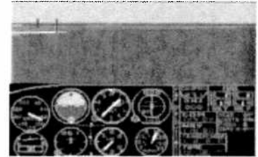
FS 1.0 – Due to monochrome graphics it is often difficult to distinguish between land, sea and sky.

The four simulated aircraft were the Gates Learjet 25, the Cessna