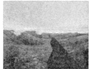
FS2000 (7.0) – Elevations levels have been improved when compared to FS98. For the first time, a GPS feature is added.