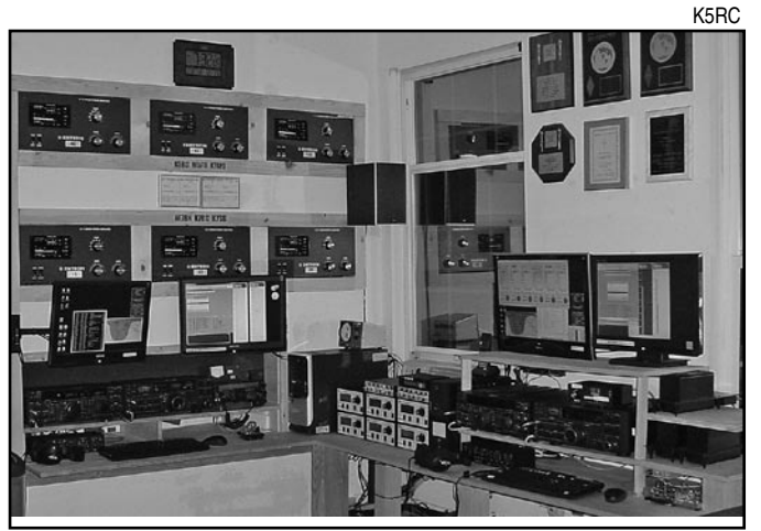
Figure 5—After: The completed remodeling job