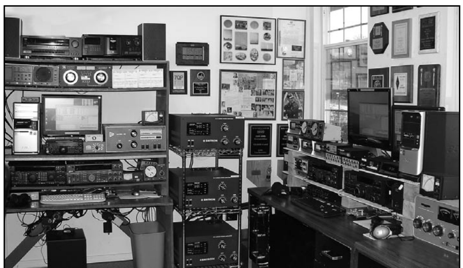
Figure 1— Before: The Phase I station configuration before the 2007 CQ WW CW Contest