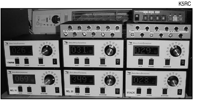
Figure 4—Rotor and antenna controls

While waiting for the three Emtron amps to arrive from Australia, we had to resolve other issues on the checklist. The solutions to the heat, noise, rotor access, antenna switching and station layout issues presented themselves in the form of